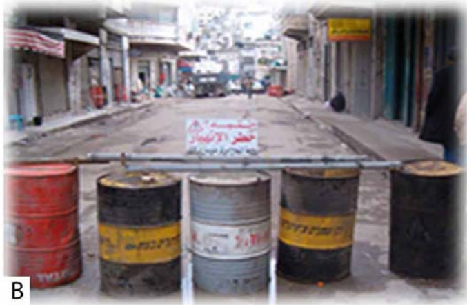
B Expulsion of blocks in poor mortar stone